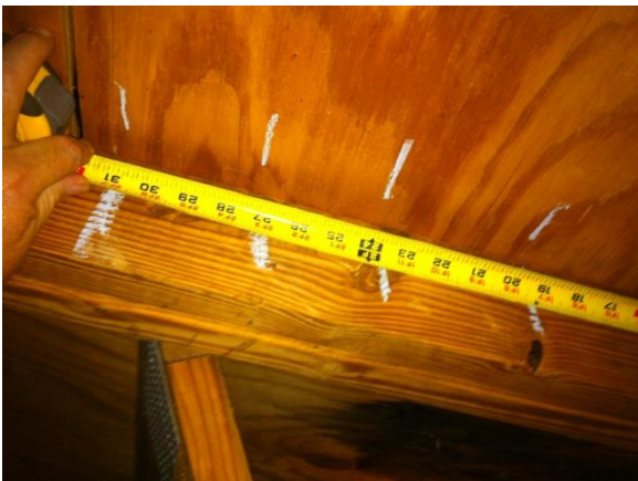
SHEATHING NAIL SPACING