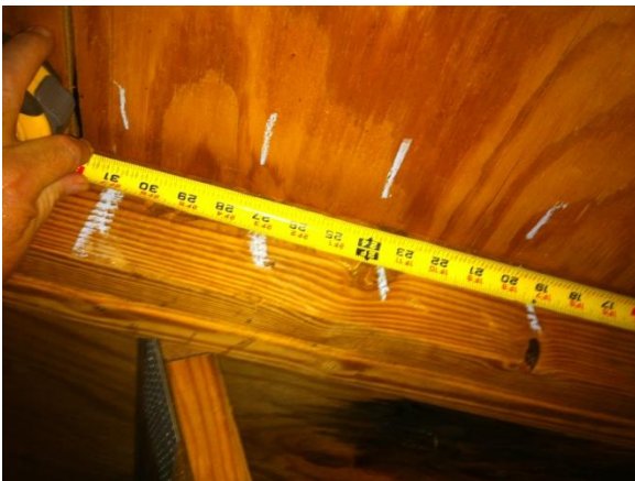
SHEATHING NAIL SPACING