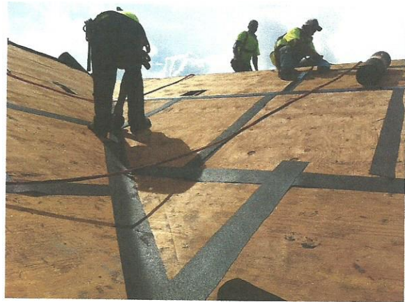
S.W.R. AND SHEATHING