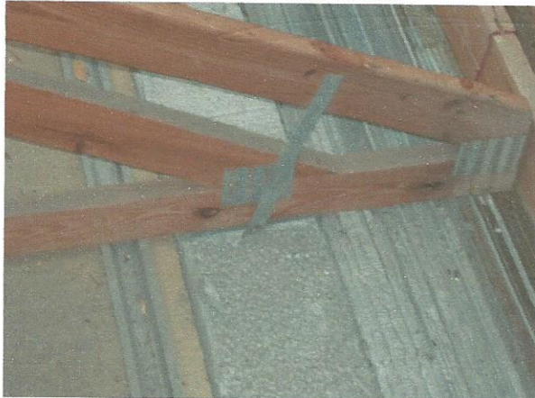
TRUSS STRAP W/ 3 NAILS