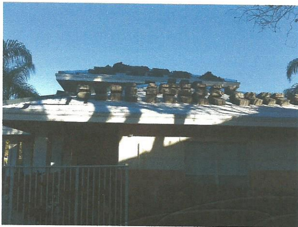
TILE LOADED ON TU-POLYSTICK