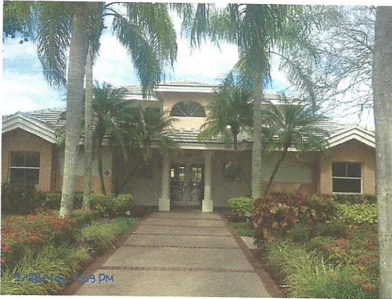
ELEVATION VIEW – CLUBHOUSE